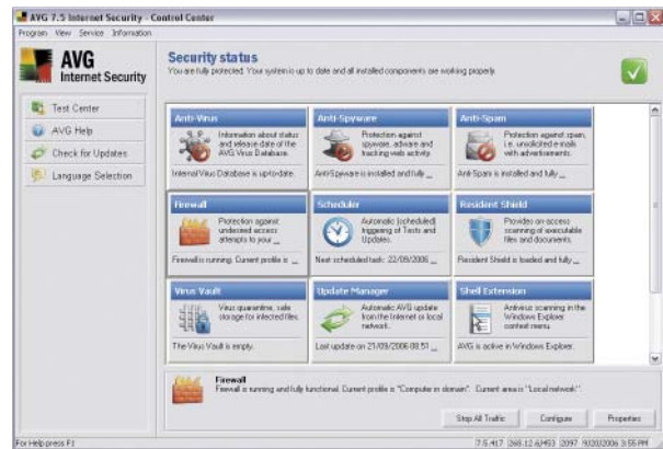
AVG Internet Security Control Center